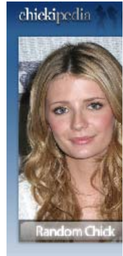
Random Chick - see